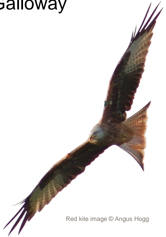
Red kite image

The population of red kites in Dumfries & Galloway is growing and expanding in range. As it is difficult to monitor every single kite in the area, it is not possible to give a reliable estimate of the 'number of individual kites'. Like all species, the early years of red kites are their most dangerous. A third of fledged young will be lucky to survive their first winter, although if they do, their future survival is more certain. Owing to some young kites' propensities for dispersing, some after fledging and some the following spring, survival and population numbers can only ever be an approximation. The number of breeding kites, currently at 224 individuals ( 112 pairs ), is a much more reliable indicator of our minimum population in the region.